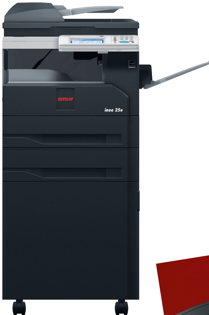
ineo 25e with paper tray (PF-508), large desk (SCD-26L) and external job separator (JS-604)

If you're looking for a compact, convenient and easy-to-use office device that can print, copy, scan and fax, there's no better solution than the ineo 25e from DEVELOP. This multifunctional monochrome device is ideal for small teams in any kind of business.