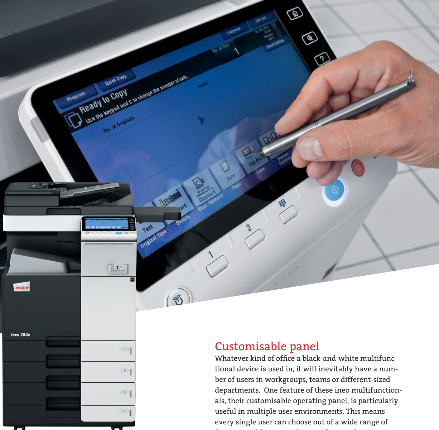
ineo 284e with dual scan document feeder (DF-701), paper feeder (PC-210) and working table (WT-506)