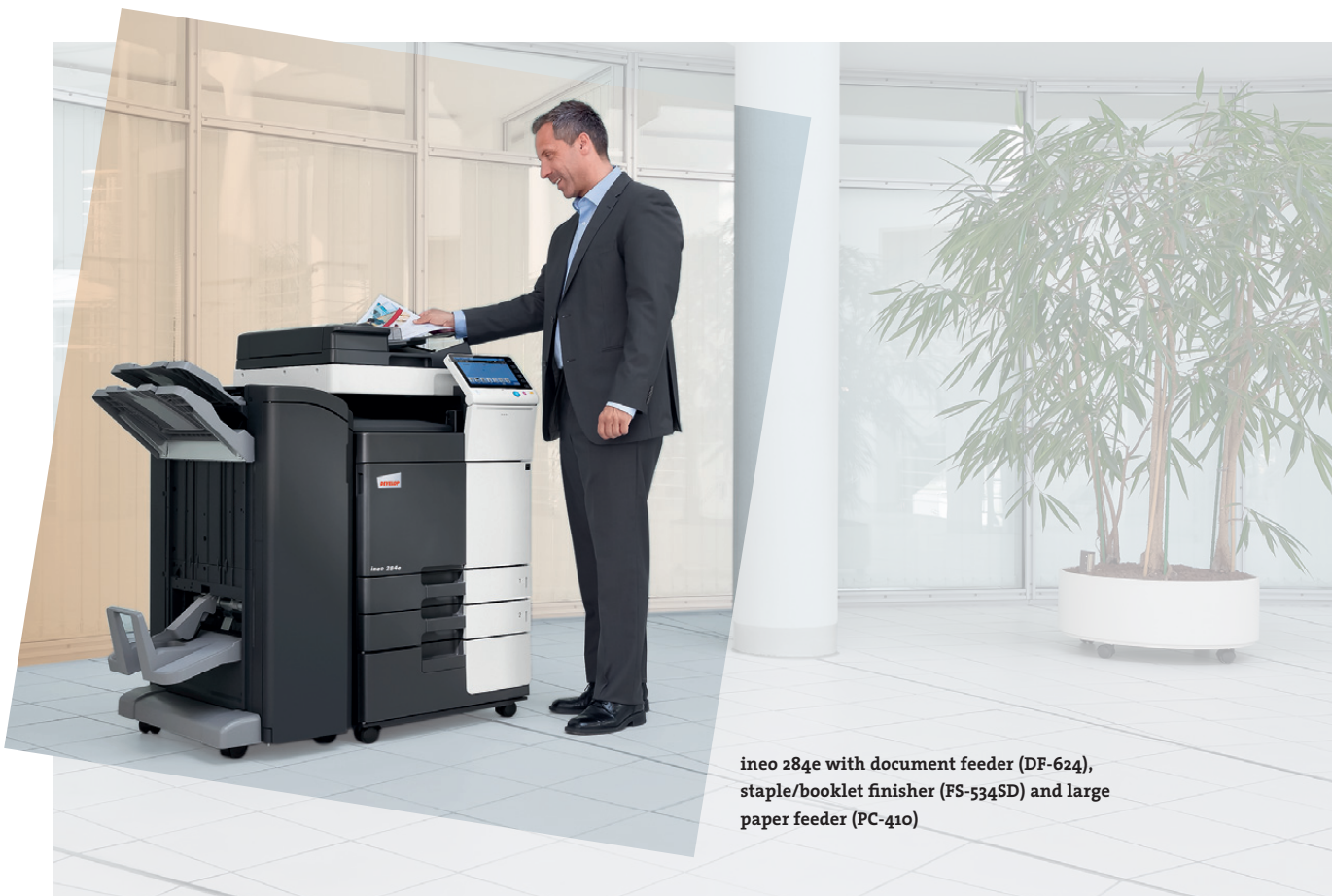
ineo 284e with document feeder (DF-624), staple/booklet finisher (FS-534SD) and large paper feeder (PC-410)

These black-and-white systems come with a number of energy-saving features that cut power consumption by over 40% compared to predecessor models. While this kind of economy saves money, other green features are ecologically beneficial. And that means DEVELOP's ineo e line-up is not only good for the environment but also boosts the owner's green credentials.