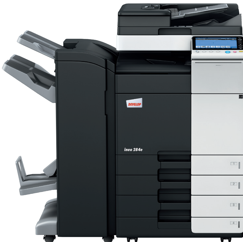
ineo 284e with dual scan document feeder (DF-701), staple/booklet finisher (FS-534SD) and paper feeder (PC-210)

Each of these multifunctional office devices – the ineo 224e, ineo 284e, the ineo 364e, the ineo 454e and the ineo 554e – is not only remarkably easy to use but also offers a wide variety of features to facilitate everyday office tasks. By saving office users time in printing, copying or scanning, they can return to their normal work faster. And that will ultimately help boost productivity.