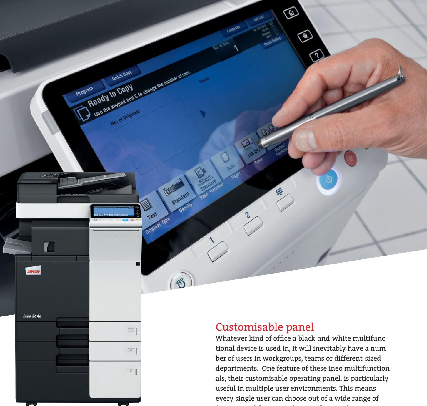
ineo 364e with document feeder (DF-624) and large capacity tray (PC-410)