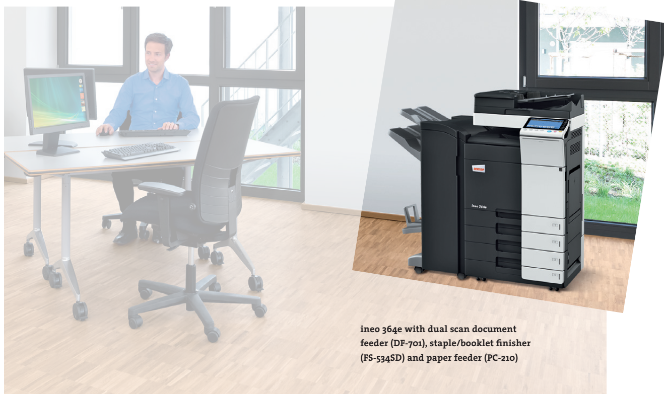
ineo 364e with dual scan document feeder (DF-701), staple/booklet finisher (FS-534SD) and paper feeder (PC-210)

These black-and-white systems come with a number of energy-saving features that cut power consumption by over 40% compared to predecessor models. While this kind of economy saves money, other green features are ecologically beneficial. And that means DEVELOP's ineo e line-up is not only good for the environment but also boosts the owner's green credentials.