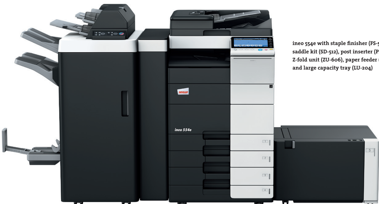
ineo 554e with staple finisher (FS-535), saddle kit (SD-512), post inserter (PI-505), Z-fold unit (ZU-606), paper feeder (PC-210) and large capacity tray (LU-204)

Each of these multifunctional office devices – the ineo 224e, ineo 284e, the ineo 364e, the ineo 454e and the ineo 554e – is not only remarkably easy to use but also offers a wide variety of features to facilitate everyday office tasks. By saving office users time in printing, copying or scanning, they can return to their normal work faster. And that will ultimately help boost productivity.