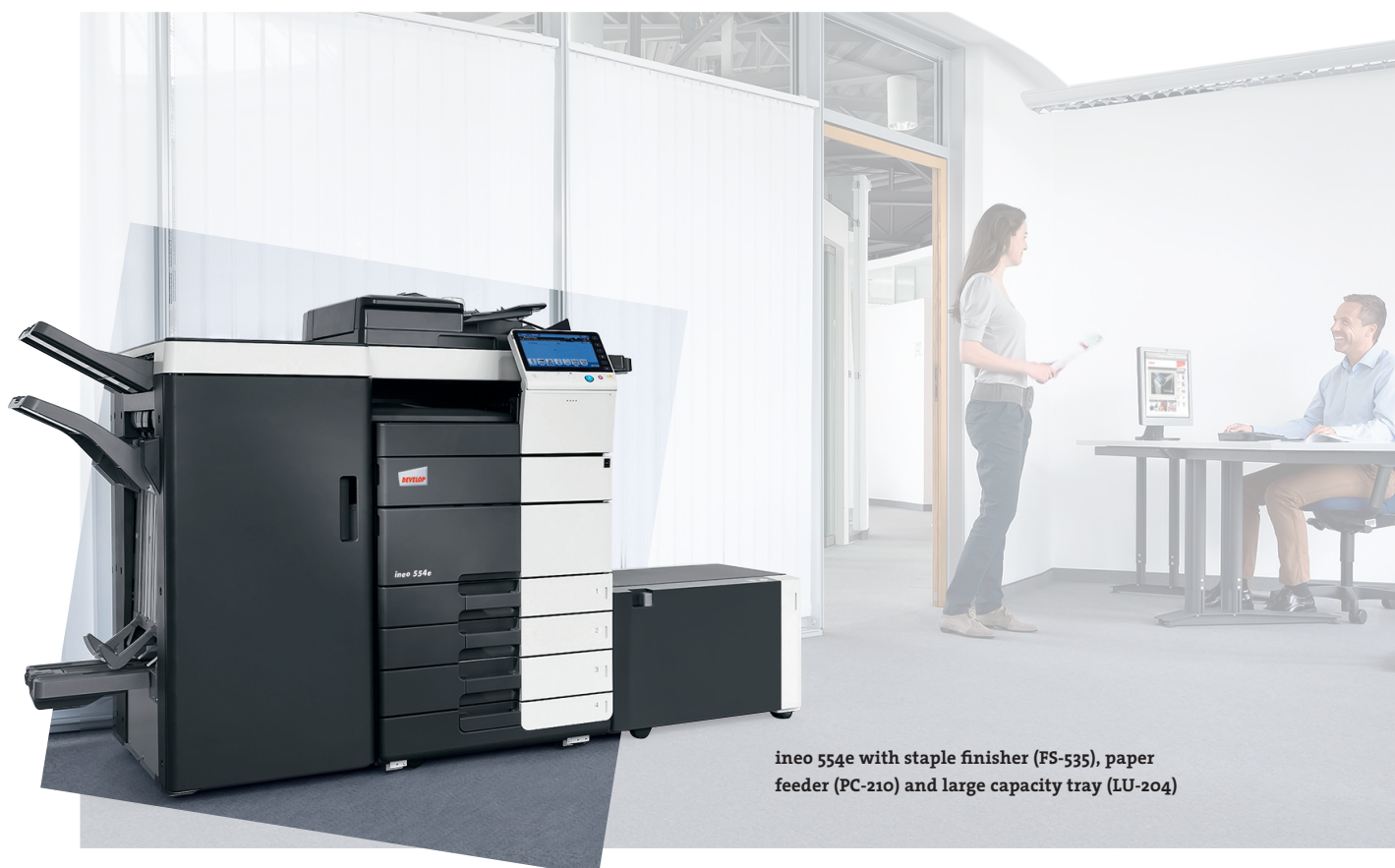
ineo 554e with staple finisher (FS-535), paper feeder (PC-210) and large capacity tray (LU-204)

These black-and-white systems come with a number of energy-saving features that cut power consumption by over 40% compared to predecessor models. While this kind of economy saves money, other green features are ecologically beneficial. And that means DEVELOP's ineo e line-up is not only good for the environment but also boosts the owner's green credentials.