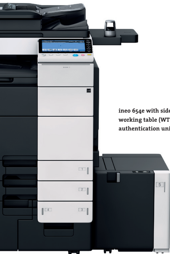
ineo 654e with side paper deck (LU-301), working table (WT-506) and finger vein authentication unit (AU-102)

The ineo 654e prints and copies at 65 A4 pages per minute (ppm). That means your staff can leave this machine to get on with any high-volume job while they carry on with their daily office work. In the multi-user environment of a departmental device or centralised office location and at an in-house printshop, this will also eliminate job queues, or at least shorten waiting times. Since this machine prints or copies in duplex mode at full speed, it will also save you money by reducing your paper consumption on high-volume jobs.