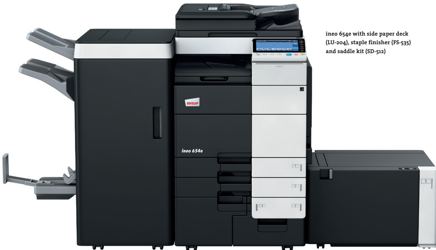
ineo 654e with side paper deck (LU-204), staple finisher (FS-535) and saddle kit (SD-512)

Viruses, Trojan horses, hacker attacks: these days, no business can afford to ignore the challenging issue of IT security. That's why the ineo 654e is certified to ISO 15408 EAL 3, the industry's security standard for multifunctional systems. What's more, it also comes equipped with numerous data-security features such as IPsec encryption, which ensures secure communication channels for all documents passing through your company's network. There is no danger of confidential documents or data getting into the wrong hands either since access to the system can be restricted to authorised users by means of the standard hard-disk encryption kit and authentication technology. This way, we ensure your sensitive data stay secure – now and in future.