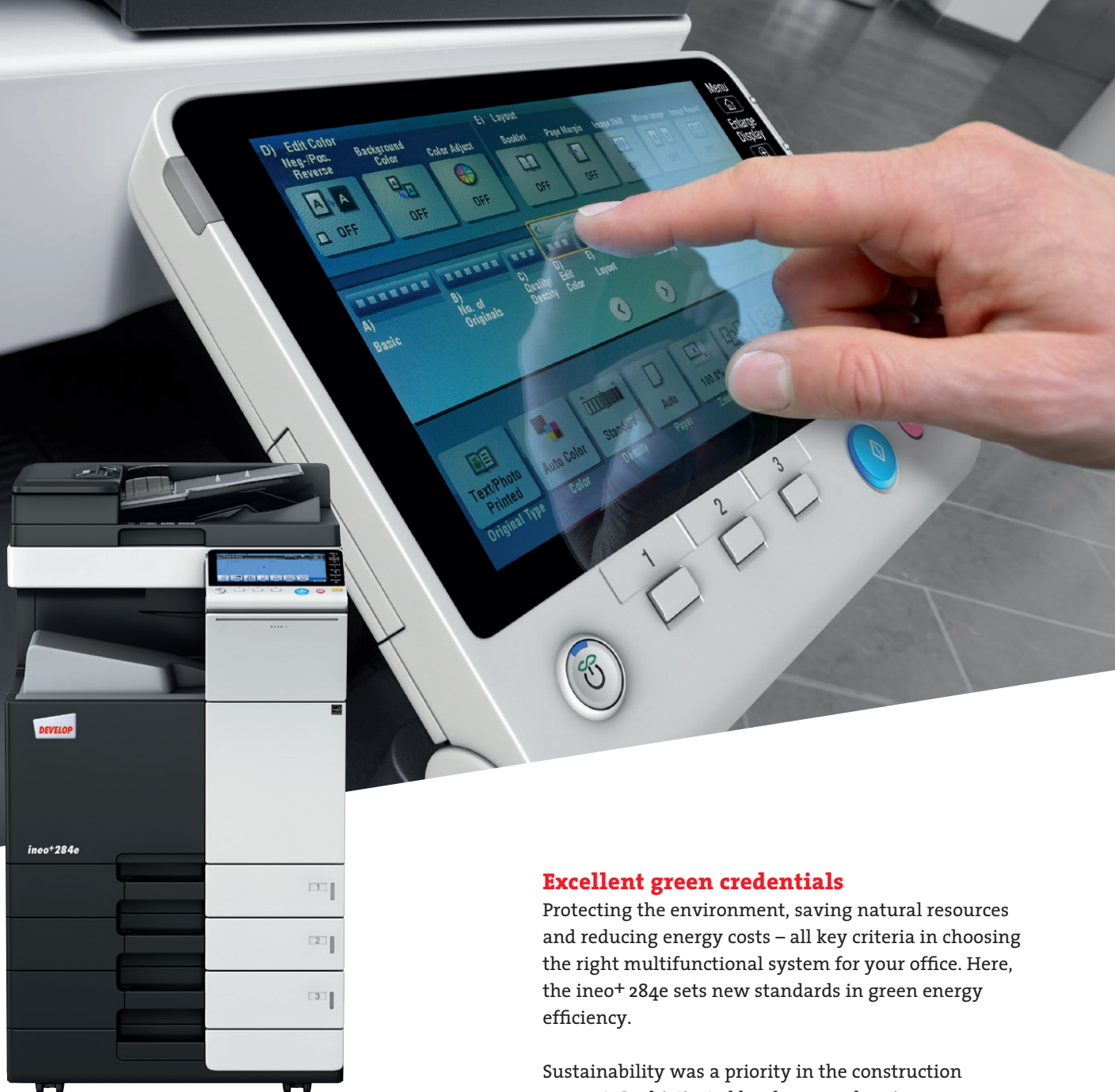
ineo+ 284e with paper feeder (PC-210) and dual scan document feeder (DF-701)