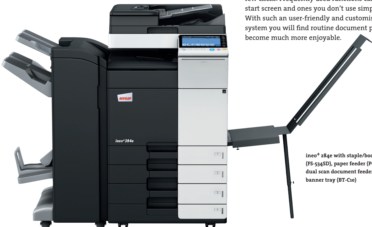
ineo+ 284e with staple/booklet finisher (FS-534SD), paper feeder (PC-210), dual scan document feeder (DF-701), banner tray (BT-C1e)

Many multifunctional office systems are anything but user-friendly. The ineo+ 284e, in contrast, is simplicity itself. An intuitive, easily understandable operating concept ensures that it is as easy to use as your smartphone or tablet. The 9-inch capacitive touchscreen comes with familiar multi-touch operations such as flick, drag&drop and pinch in&out – so you will feel at home in this system in no time at all. Thanks to a new menu navigation structure you can see all functions in one go and select the settings you want with just a few clicks. Frequently used functions can be left on the start screen and ones you don't use simply removed. With such a user-friendly and customisable office system you will find routine document production jobs become much more enjoyable.