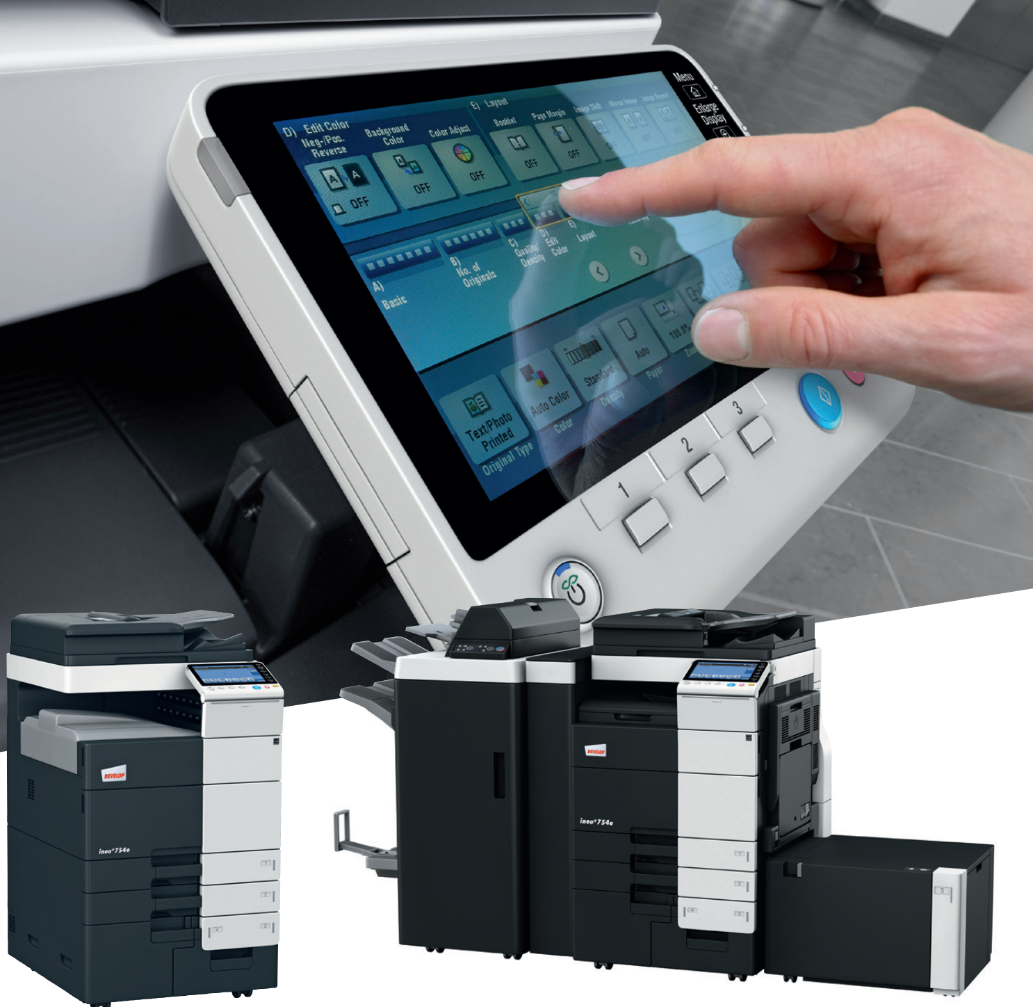
ineo + 754e with output tray (OT-503)