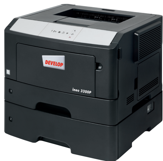
ineo 3300P with additional 550-sheet cassette (PF-P12)

If the operating system on your current printer is frustratingly difficult to follow and the device is difficult to use, it's time you considered switching to an ineo 3300P. Its ease of use will save your and your staff's time and effort in everyday printing jobs. And nobody will have to consult an operating manual before using this new printer.