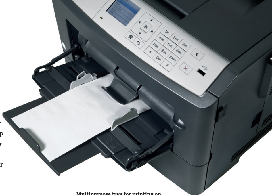
Multipurpose tray for printing on special media such as envelopes

Are high-volume print jobs commonplace in your business? With a maximum capacity of 2,000 sheets you can be sure that the ineo 4000P will not run out of paper. And if you frequently print on different kinds of paper, e.g. with or without your corporate logo, you can have your ineo 4000P equipped with up to three paper trays (with 250 or 550 sheets). If the trays are stocked with different kinds, sizes and weights of paper (A6–A4 and 60–163 g/m 2 ), you ensure your staff to waste no time switching from one kind of paper to another, or running back to a printer that has run out of paper.