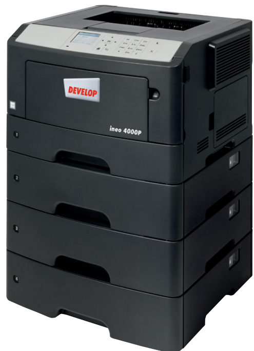
ineo 4000P with three additional paper cassettes (PF-P12)

If the operating system on your current printer is frustratingly difficult to follow and the device difficult to use, it is time you considered switching to an ineo 4000P. Its 2.4-inch colour display ensures intuitive operability and highlighted menus show users the system's status, operating options and settings. What's more, a folder-like navigation concept means the ineo 4000P is easier to use than many older systems. This saves your staff time and effort in everyday printing jobs. And nobody will have to consult an operating manual before using this new printer.