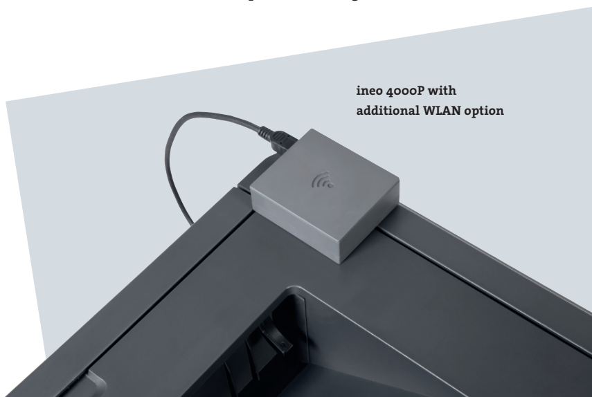
ineo 4000P with additional WLAN option

* Please note: up to 3 PF-P11 or PF-P12 trays can be combined with each other