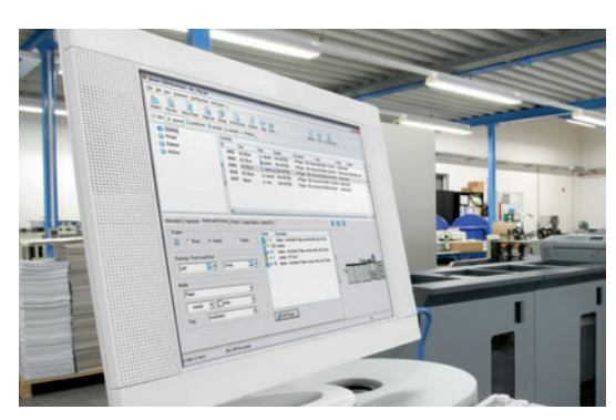
Easy integration in an existing workflow